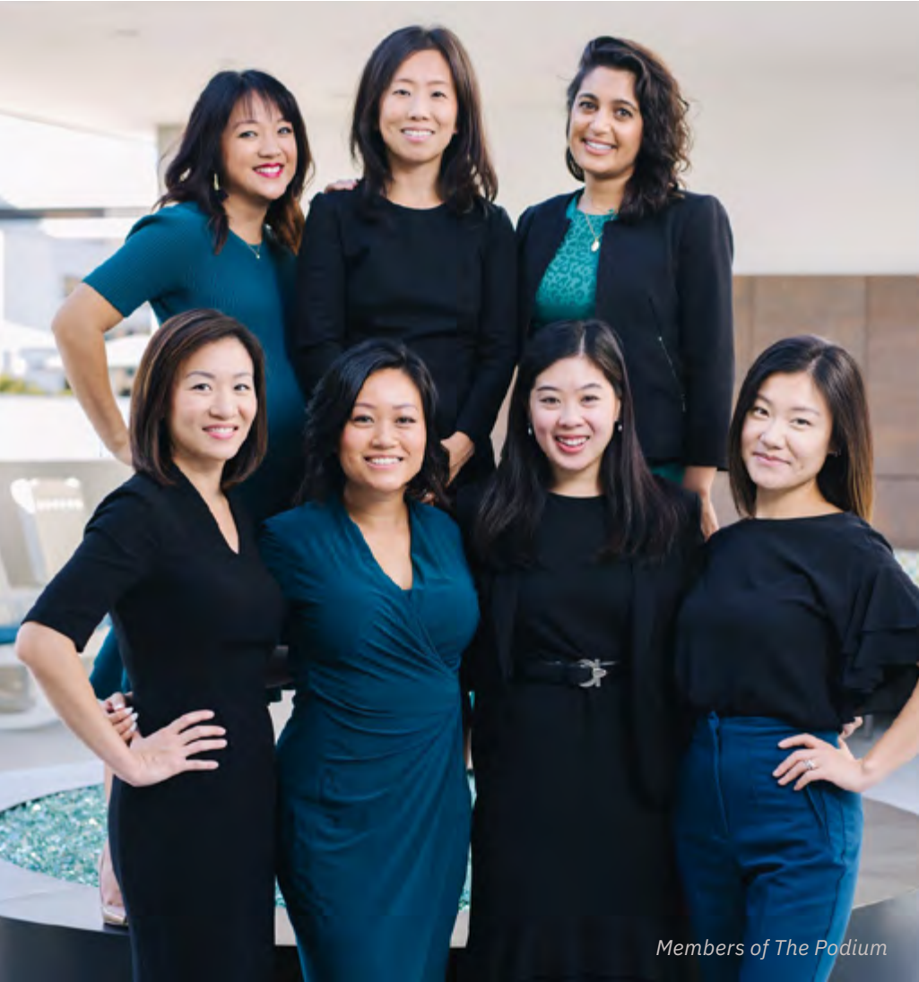
Members of The Podium

That makes her legal practice a lot like her passion project, The Podium.