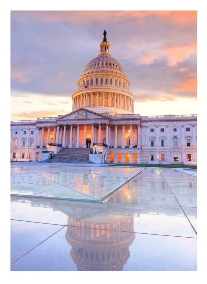
Pending U.S. Supreme Court Decision, United States ex rel. Jefferson v. Roche Holding AG, et al., No. 1:14-cv-03665 (D. Md. Nov. 16, 2022), Dkt. No. 147.

So, it is likely we will have clarity or resolution of the circuit split sometime in 2023 when the Supreme Court issues its decision in that case. At least one district court has stayed proceedings in which a government motion to dismiss is pending until the Supreme Court issues its decision. See Order Granting Motion to Stay Proceedings