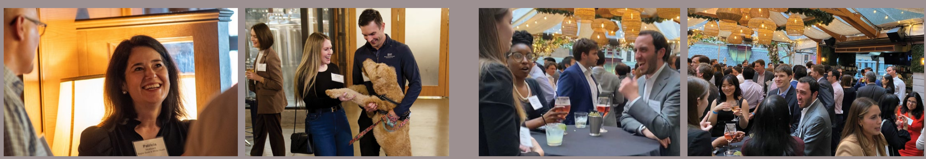
NEXT GEN EVENT - DALLAS - OCTOBER 2022