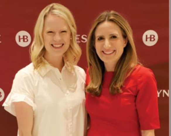
WOMEN'S FASHION EVENT - DALLAS - OCTOBER 2023