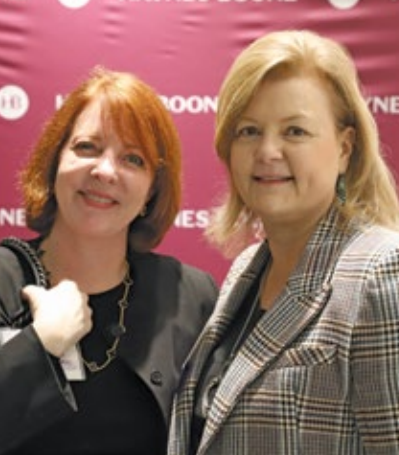
HOLIDAY SHOPPING EVENT - DALLAS - NOVEMBER 2023

DALLAS OFFICE OPEN HOUSE - FEBRUARY 2024