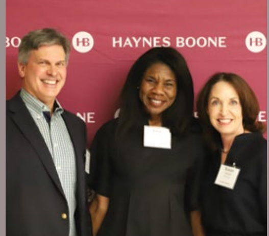
AUSTIN OFFICE OPEN HOUSE - FEBRUARY 2024