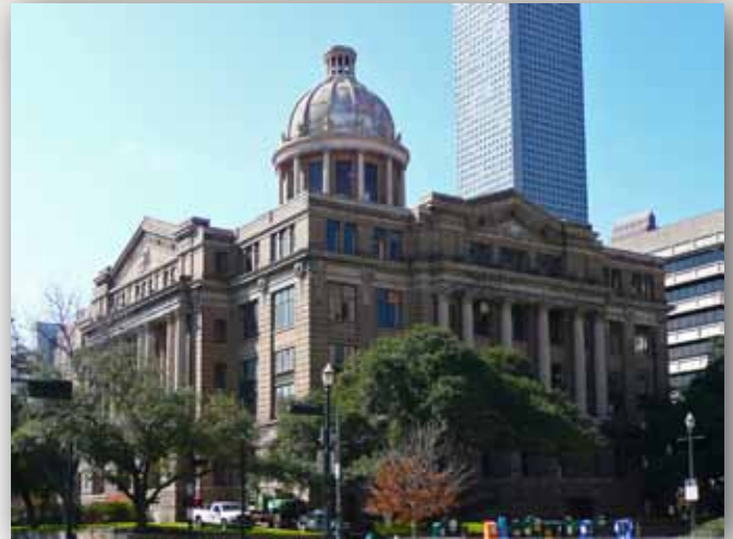
1910 Harris County Courthouse

For the past 16 years, the Society has held its Board meetings in Austin. Trustees from Houston are excited about hosting the meeting in their city.