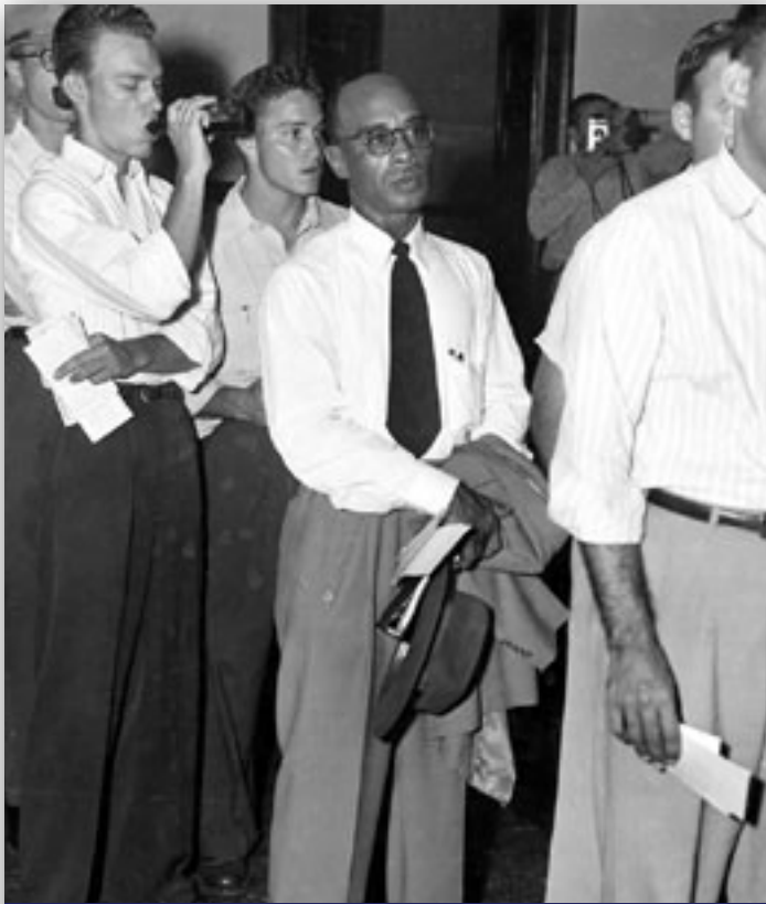
Heman Marion Sweatt